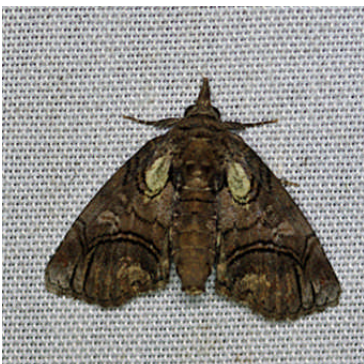
08959 SPM021650 bitternut campground farmington 6-5-...