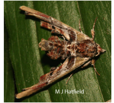
08956 SPM019539 marathysa basalis tulamore story mj 5-...