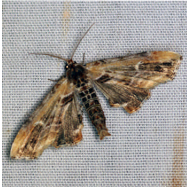
08956 SPM026172 Donnelson unit shimak state forest 4-12...