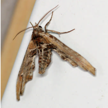
08955 SPM026807 matsell bridge 5-6-2012 (108).JPG