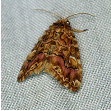
09631 SPM021707 bitternut campground farmington 6-5-...